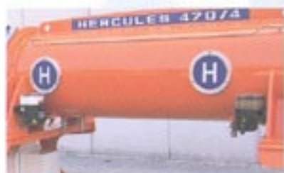
Electronic control boxes for centralised lubrication of bowl bearings and sludge scraper.

ALL PARTS IN CONTACT WITH THE PRODUCT ARE IN STAINLESS STEEL